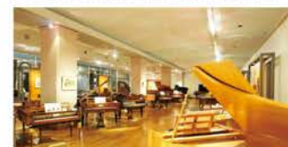
Hamamatsu Museum of Musical Instruments The world's foremost musical instrument museum, with around 1,300 instruments from around the world on regular display