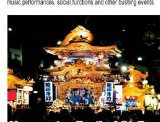
Hamamatsu Festival Stalls The Hamamatsu Festival is held every year on May 3, 4 and 5, with Japanese music and festival stalls lining Kajimachi Street each night