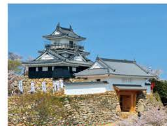
Hamamatsu Castle Because Tokugawa Ieyasu resided here for 17 years in the prime of his career, the castle is also known as the "Castle of Success"