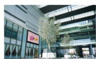
Soramo Gallery and Mall An open space adjacent to the Hamamatsu Station, used to host music performances, social functions and other bustling events